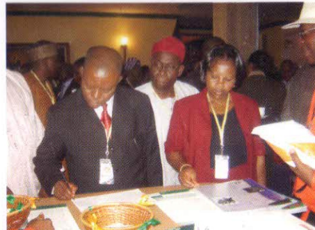
SystemSpecs stand was a beehive of activities.