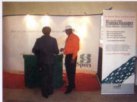
A full view of the SystemSpecs stand.

Below are some pictures that captured the event: